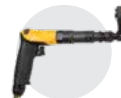
Installation & removal tools