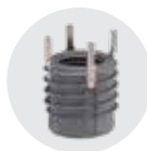
Inserts & studs