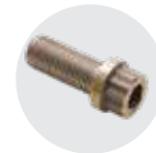
Bolts & Screws