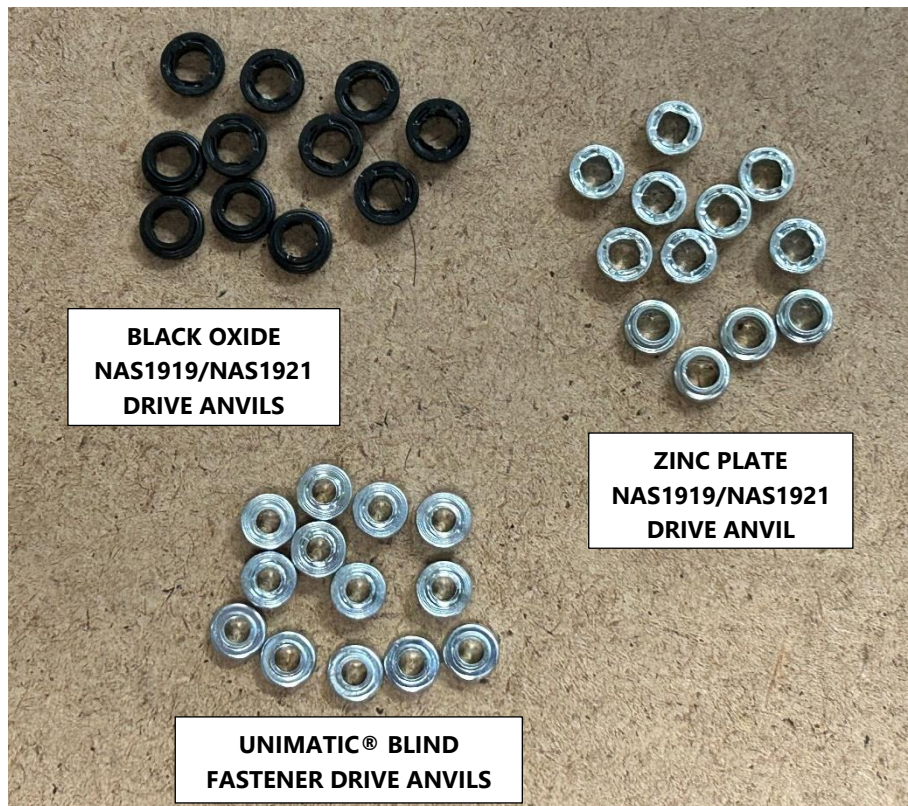
DRIVE ANVILS, NAS1919/NAS1921 & UNIMATIC® BLIND FASTENER